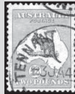
● The Two Pound Roo