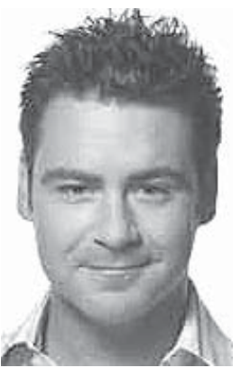
● Andrew O'Keefe

Just what is it with the love affair between Channel 7 owner Kerry Stokes and presenter Andrew O'Keefe?