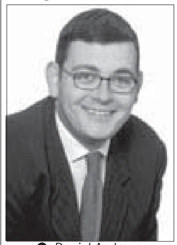
● Daniel Andrews

The State Government has provided a massive funding boost to Alexandra Hospital with the vital health service to receive $4.69 million this financial year, about $158,000 more than in 2007-08.